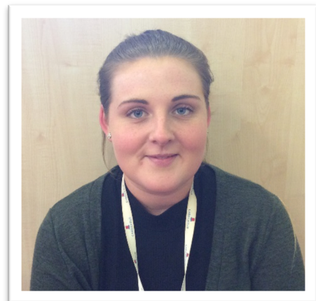
Miss Eddington SVQ 2 & 3: Childcare and Development Nursery Practitioner