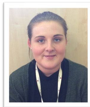
Miss Eddington SVQ 2 & 3: Childcare and Development Nursery Practitioner