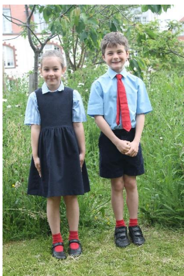
Summer Term Sportswear

All stationery will be provided so pencil cases are not required.